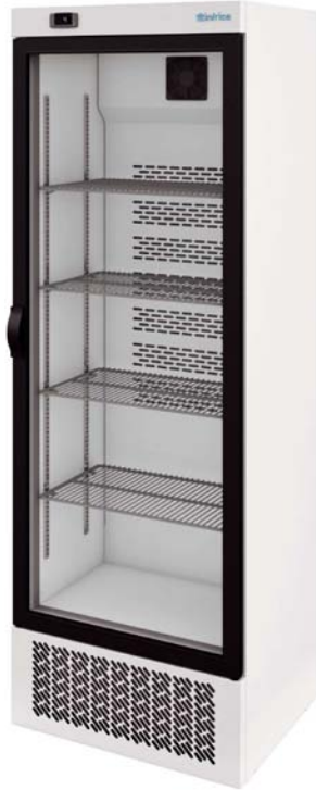
ERC 36 B